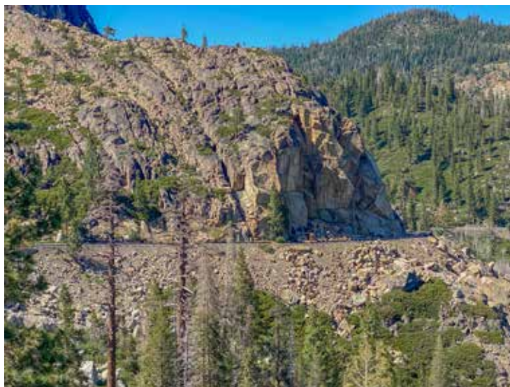
The rock fall area

Parenthetically, it's been quite amazing at the number of people in automobiles, on bikes, or even just walking who don't believe the road closed signs. Just while we were getting our initial update a half dozen cars and once bicyclist approached the barrier. Some of the big rocks are getting ready to fall. They may not fall immediately, but who wants to be there when they do? Did we mention that one is about 100 tons? A nice road bike or SUV is no match.