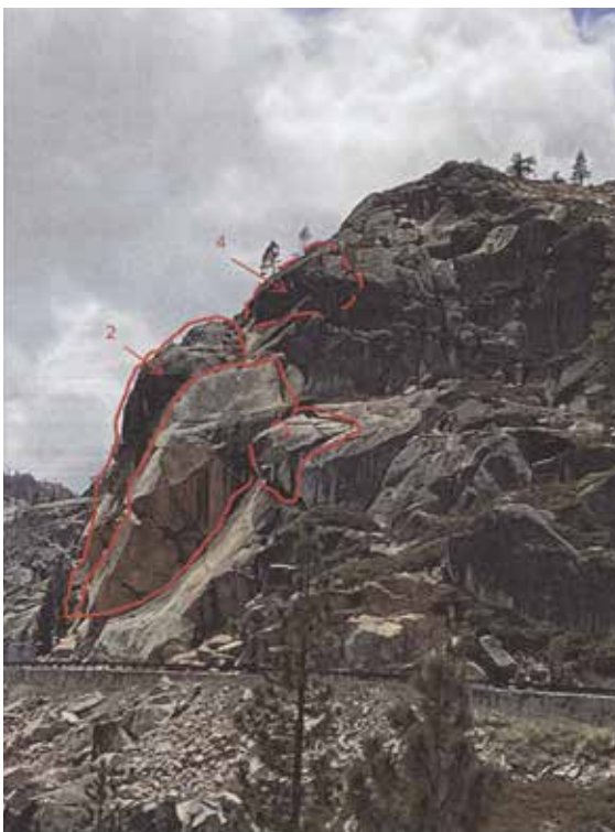
The rock face is riddled with cracks, one is twenty-five feet deep.

Once the initial analysis is done plans can be made for the long-term solutions. Those include removing loose rock and drilling bolt holes for long anchor bolts to bolt the face to the rock behind. Another solution calls for inserting inflatable pillows into the cracks that can assert many tons of force to break off rocks. Then the road can reopen. The drilling should be interesting. One method uses