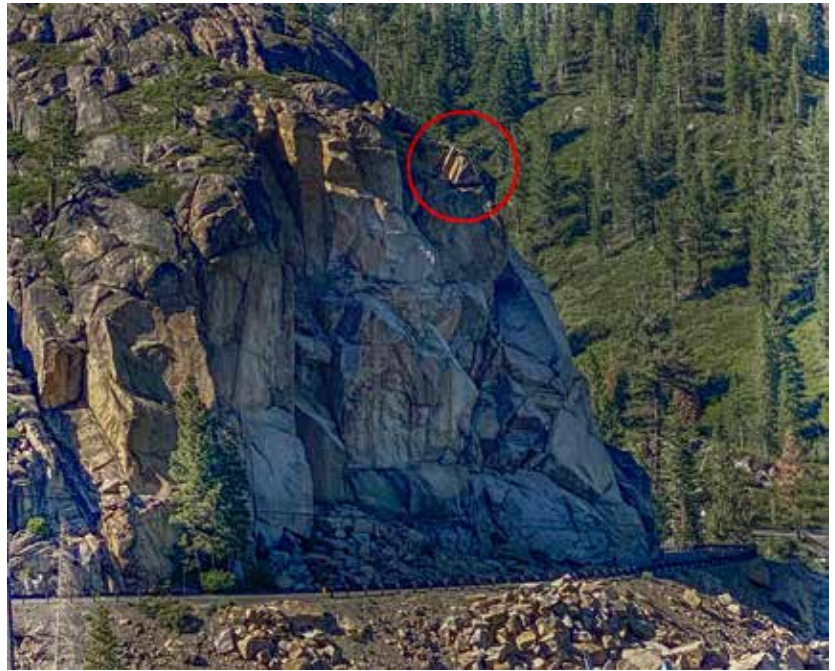
Within the red circle is the about 100 ton boulder with the twenty-five foot crack which extends down to the soil.

Rocks are brittle and so where soil slides can give some warning, the rocks don't give much. That makes things particularly dangerous and why the road cannot reopen immediately. For now, the place is "very scary," said one of the engineers.