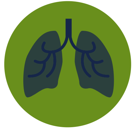
Shortness of Breath